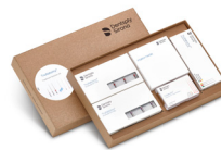
B 00 XSP0 TNO KIT

X-Smart® Pro+ ProTaper Ultimate® AH Plus Jet® Root Canal Sealer