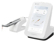
6779008 X-Smart® Pro Endo Motor

X-Smart® Pro+ Endo Motor with Integrated Apex Locator, Mini Contra Angle with Integrated LED, 360° Adjustable Position Stainless Steel Handpiece Sheath, Magnetic Handpiece Holder, Accessories Box (charger with universal power adapters), Lip Clip, File Clip, Y-Connector Cable