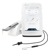
6779016 X-Smart® Pro+ Endo Motor with Integrated Apex Locator

X-Smart® Pro+ Endo Motor with Integrated Apex Locator, Mini Contra Angle with Integrated LED, 360° Adjustable Position Stainless Steel Handpiece Sheath, Magnetic Handpiece Holder, Accessories Box (charger with universal power adapters), Lip Clip, File Clip, Y-Connector Cable