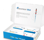
B 00 XSP0 RCB KIT

X-Smart® Pro+ TruNatomy® AH Plus Jet® Root Canal Sealer