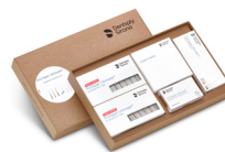
B 00 XSP0 PTL KIT

X-Smart® Pro+ WaveOne® Gold AH Plus Jet® Root Canal Sealer