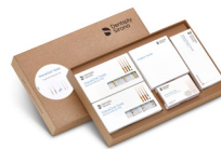
B 00 XSP0 WIG KIT

X-Smart® Pro WaveOne® Gold AH Plus Jet® Root Canal Sealer