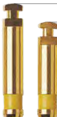
ProTaper 13 mm